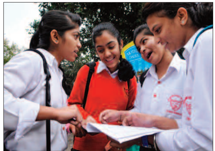
Government decided to withdraw the OTBA Scheme

OTBA was introduced by CBSE in Class 9 for Hindi, English, Mathematics, Science and Social Science and final examination of