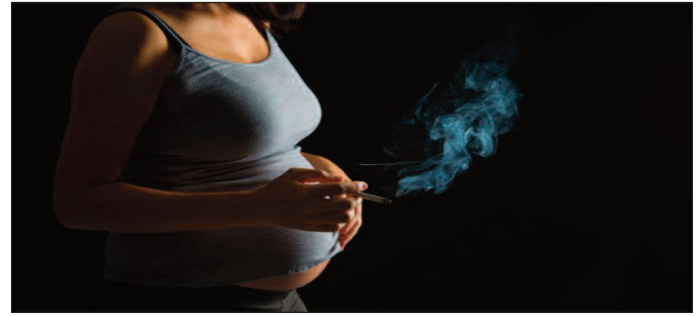
Smoking is harmful for pregnant women

Continuous use of nicotine can seriously affect our health. The use of tobacco and nicotine affect the development of the fetus as well as causing premature birth or even infant death. Birth defects, sudden infant death syndrome and low birth weight have all been associated with tobacco, electronic cigarette (e-cigarette). A research has been conducted to show the results