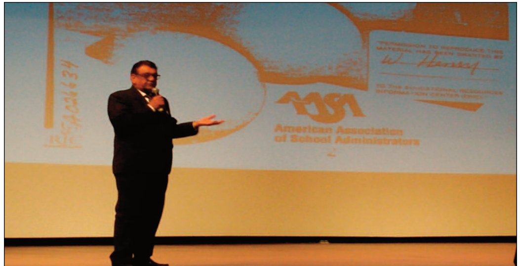
Lecture on OBE by Vice Chancellor, Subharti University