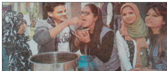
I FREAK Celebrated in Management College