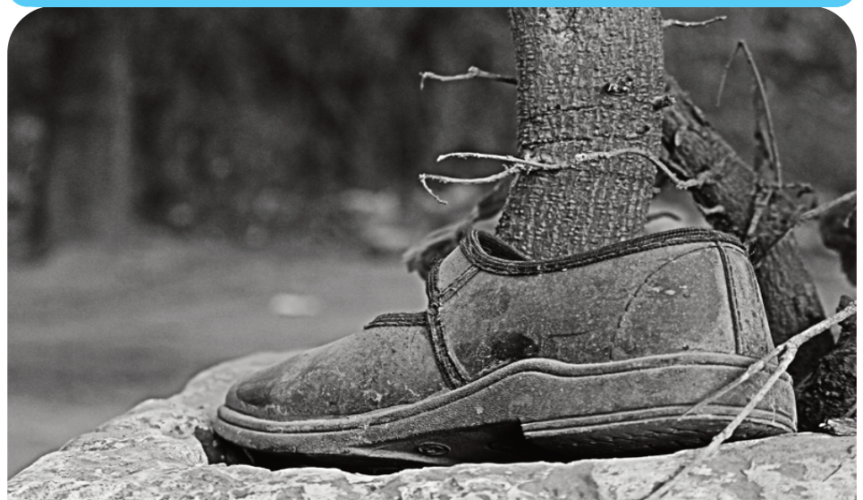
Dream of Education Remains Behind